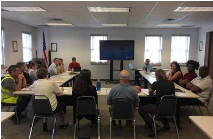
First VLWG Meeting

Some of the stakeholders were meeting for the first time. A member of the Community Progress Team facilitated the meeting, providing support to the City's Neighborhood Stabilization Coordinator. At this inaugural meeting, Community Progress conveyed observations gained to date—based on partner research, interviews, and programmatic analysis—and challenged the group to identify priorities for an ongoing agenda.