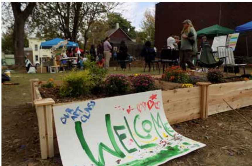
Neighborhood Event, Lots to Do, Lots for You