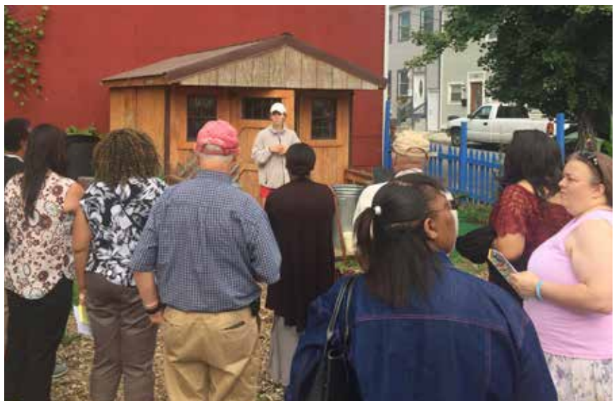
Albany Resident Delegation in Pittsburgh

The roundtable, which was held in Albany in October, was intended to serve as a forum to share highlights from the learning exchange in Pittsburgh; increase understanding of local priorities