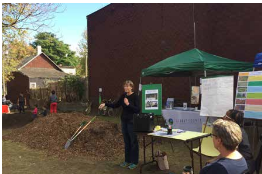
Neighborhood Event, Lots to Do, Lots for You