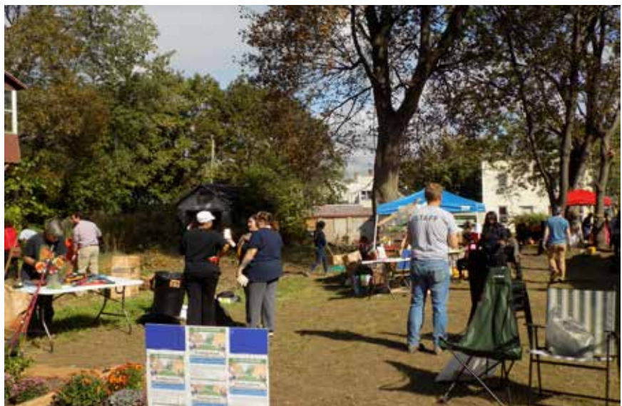
Neighborhood Event, Lots to Do, Lots for You

L2DL4U was an outstanding success. The weather was unseasonably warm, and community members showed up in force to assist with the lot clean up, provide input for the Vacant Land Toolkit, and provide their input on the proposed stewardship program. Through the course of